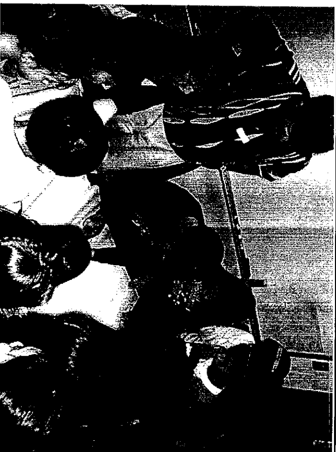
Belmont Hills Career Week

"Do you remember what you wanted to be when you were in third grade?" Belmont Hills third graders are posing that question to special guest speakers this week as they host a first-ever Career Week. A total of 27 presenters have come to speak with students about their career choices. Guests have included shop owners, lawyers, nurses, dentists, accountants, QVC buyers, philanthropists, custodians, athletic directors, coaches, a principal and even a superintendent. Career Week is the culminating project of a month-long exploration about the traits and skills that children possess and the types of jobs that may most enjoy. The lessons have been planned in conjunction with the school counselor as part of the new state counseling curriculum.